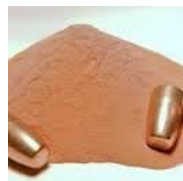
Sinterfire Frangible bullets, and associated powdered metal that makes them up.

To breakdown those pros and cons, it is first important to define the Sinterfire frangible bullet. The Sinterfire bullet is made up of copper and tin powder, compressed in a "sintering" or heating process to form and bond the bullets together. The result is a bullet which is very hard, and looks to the untrained eye much like a traditional full metal jacket, or total metal jacket bullet. When looking closely, you can almost see the compositional difference by a slight color variant and dull appearance to the bullet itself as it is not jacketed with shined copper or plating. The intent of the standard closed nose bullets it to be "frangible" or break up when striking a substance or target harder than itself. Traditionally, this would be AR500 level steel plates for maximum frangibility. Consider taking a sugar cube in a sling shot, and slinging it against the tile on your kitchen floor. It would break down into the smaller sugar fragments that make up the cube as the cube has struck something much harder than itself. This exact picture can be duplicated for a Sinterfire projectile striking an AR500 steel plate. Why is this exciting? There are several reasons: