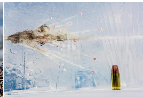
Gel block close up shot of TNQ 9mm Frang HP.

To ramp up the "Train like you Fight" mantra, TNQ also implemented into the line, a new Sinterfire technology, the Frangible Hollow Point bullet. Utilizing a very similar base product to the training round, and applying some science to the hollow point in the front end, Sinterfire in conjunction with TNQ has generated a lethal combination! This product truly provides that desire of operators to have a ballistically matched training and operational product as this product sits in the cross-over category and can be used for both training and duty/self defense use, giving the shooter exact ballistic match, felt recoil, and proven performance on every shot. For the more serious shooter, this product answers the call! Some of the added benefits are outlined below: