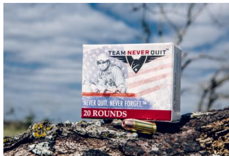
Photo of the a TNQ Frang HP round.